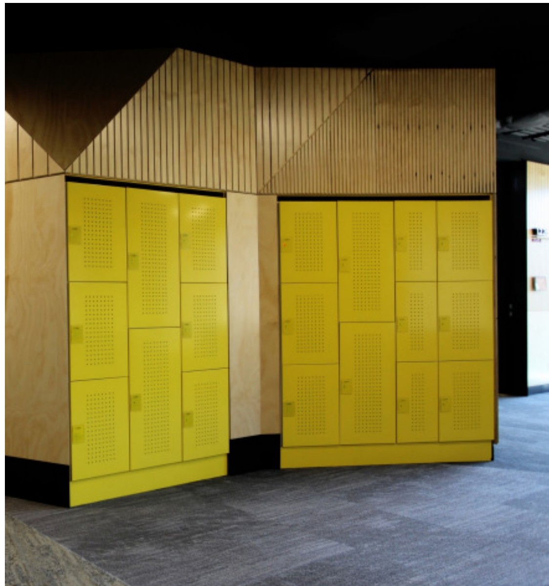
Western Sydney University, Sydney, Australia