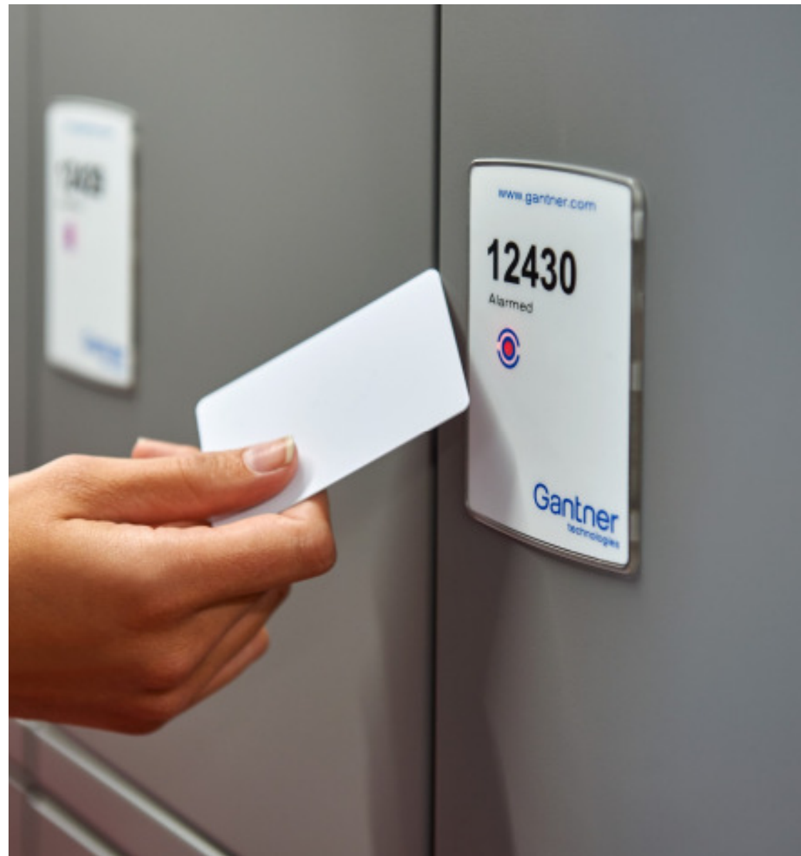
St. Gallen Hospital, St.Gallen, Switzerland