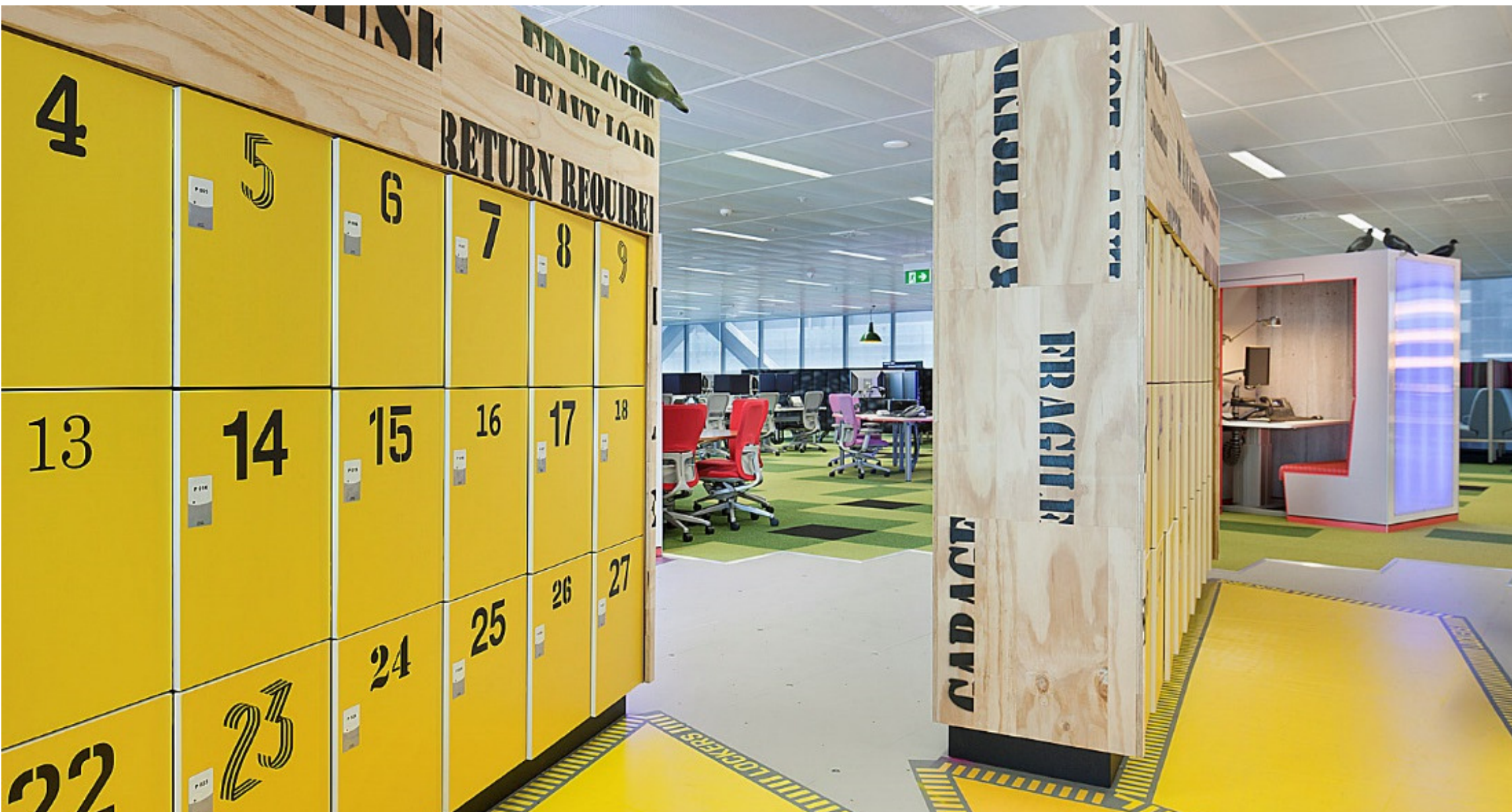
Macquarie Group, Sydney, Australia