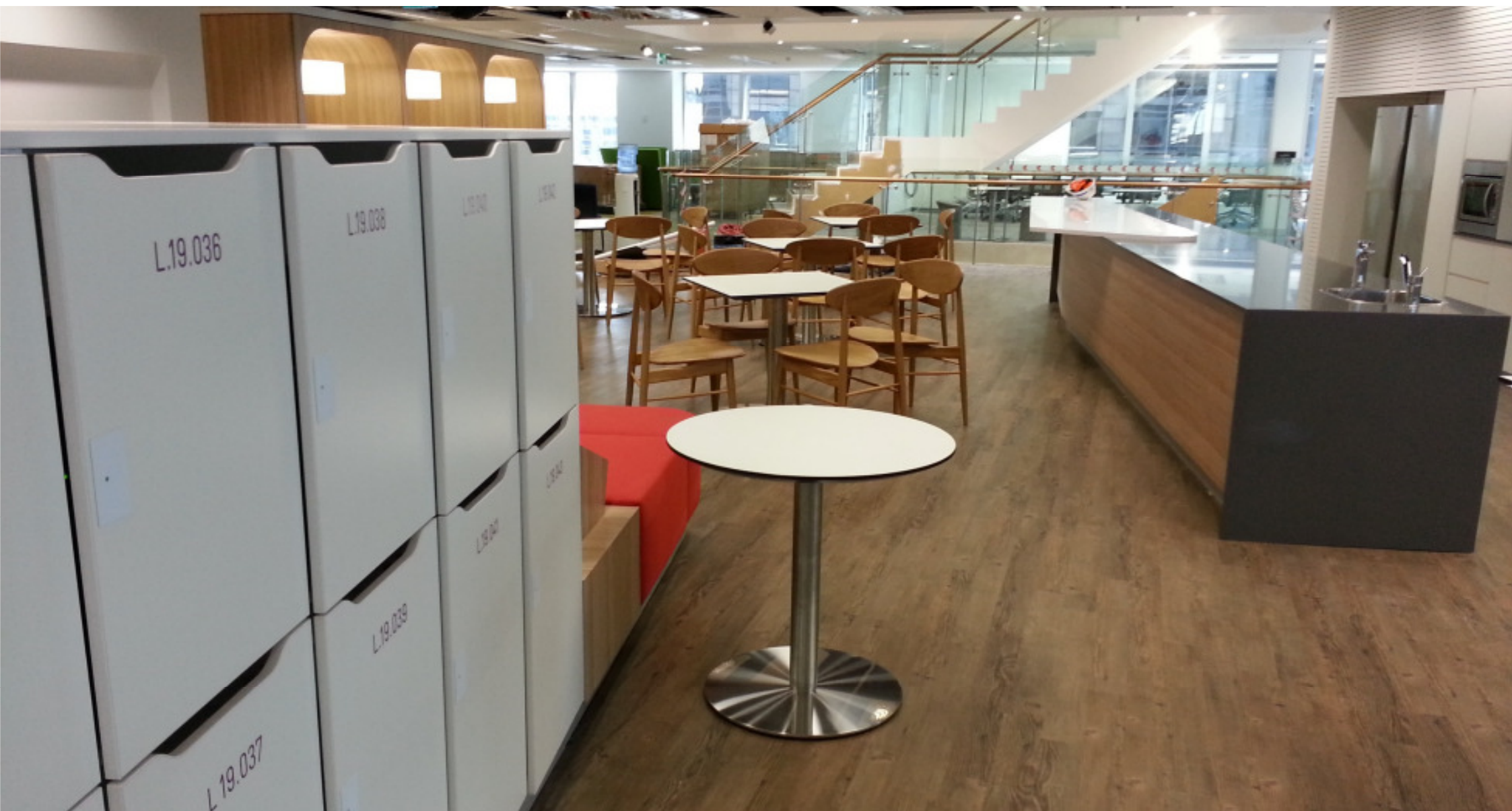
Telstra, Sydney, Australia