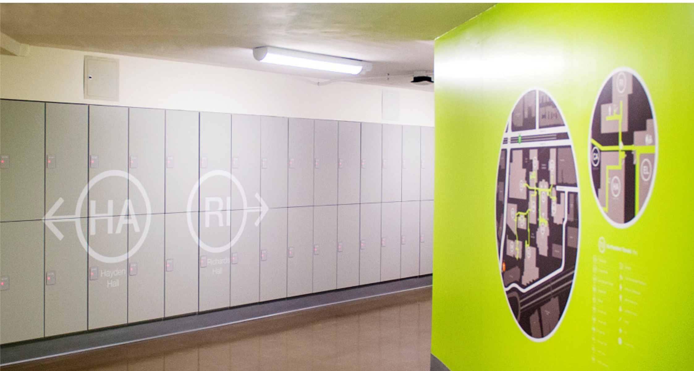
Northeastern University, Boston, USA