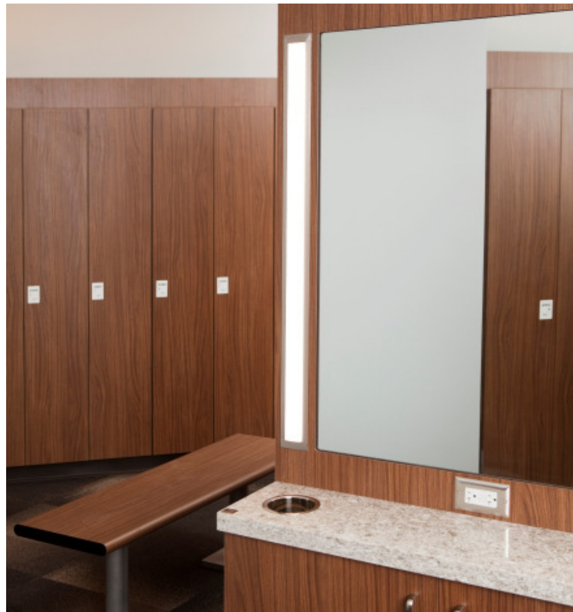
Rochester Athletic Club, Rochester, USA