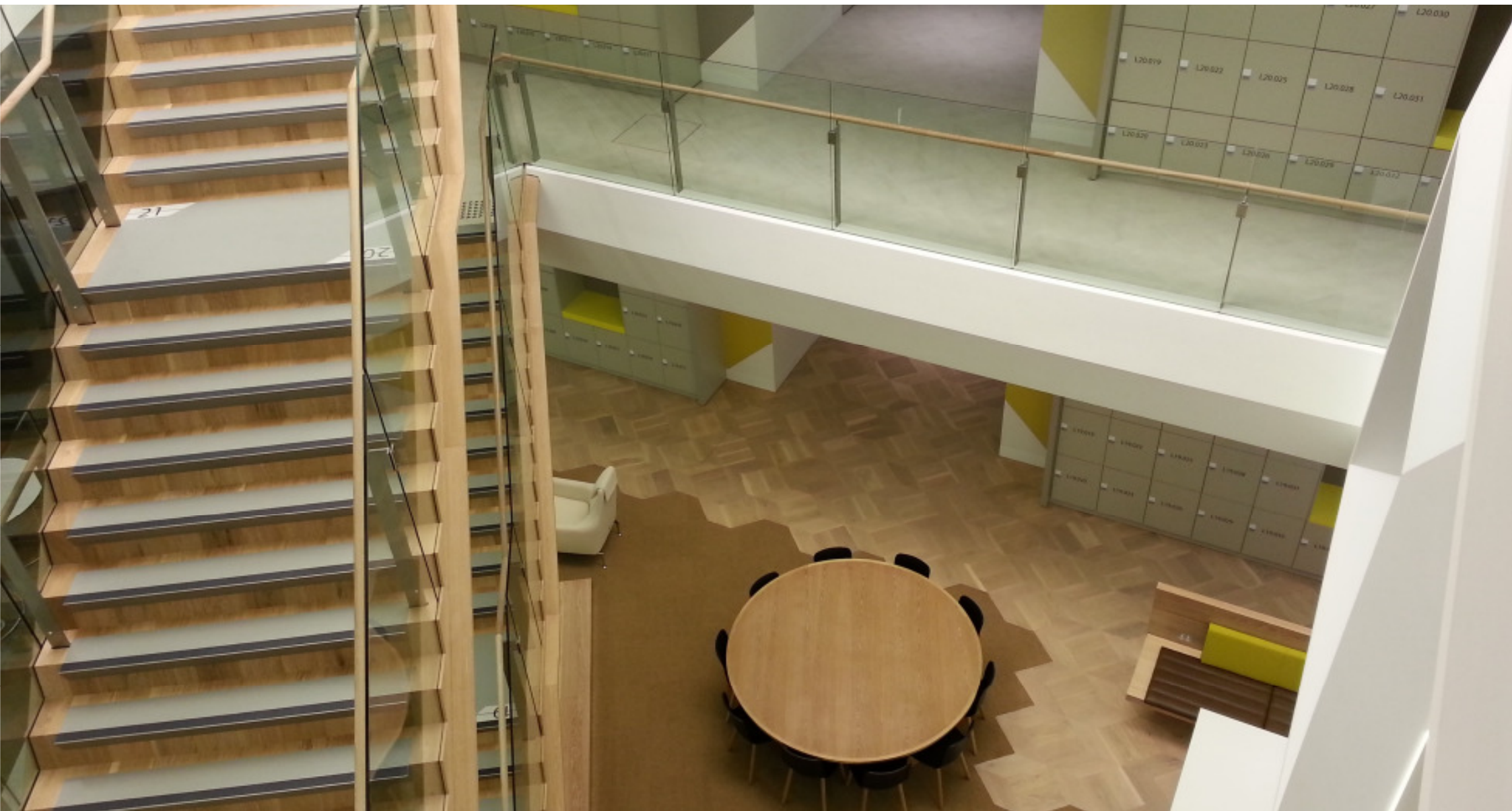
Banking Corporation, Sydney, Australia