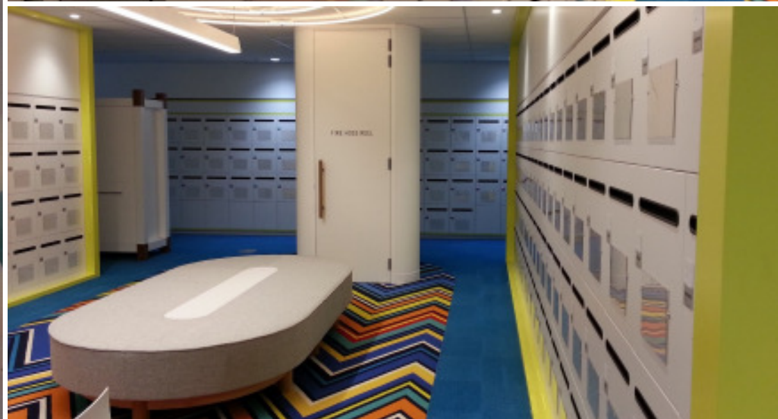
Medibank, Melbourne, Australia