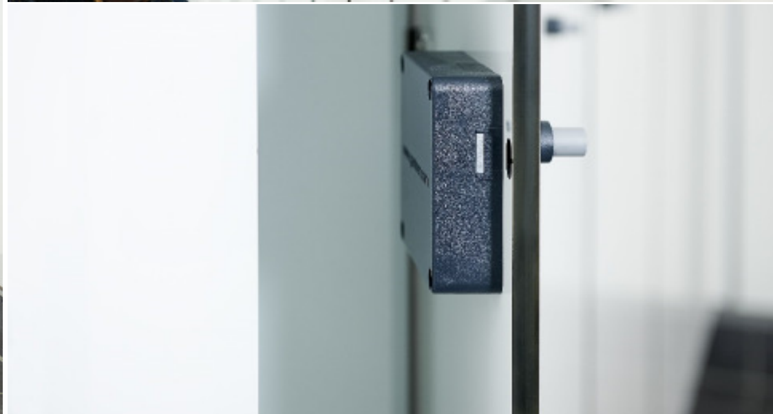
Caracalla Therme, Baden-Baden, Germany