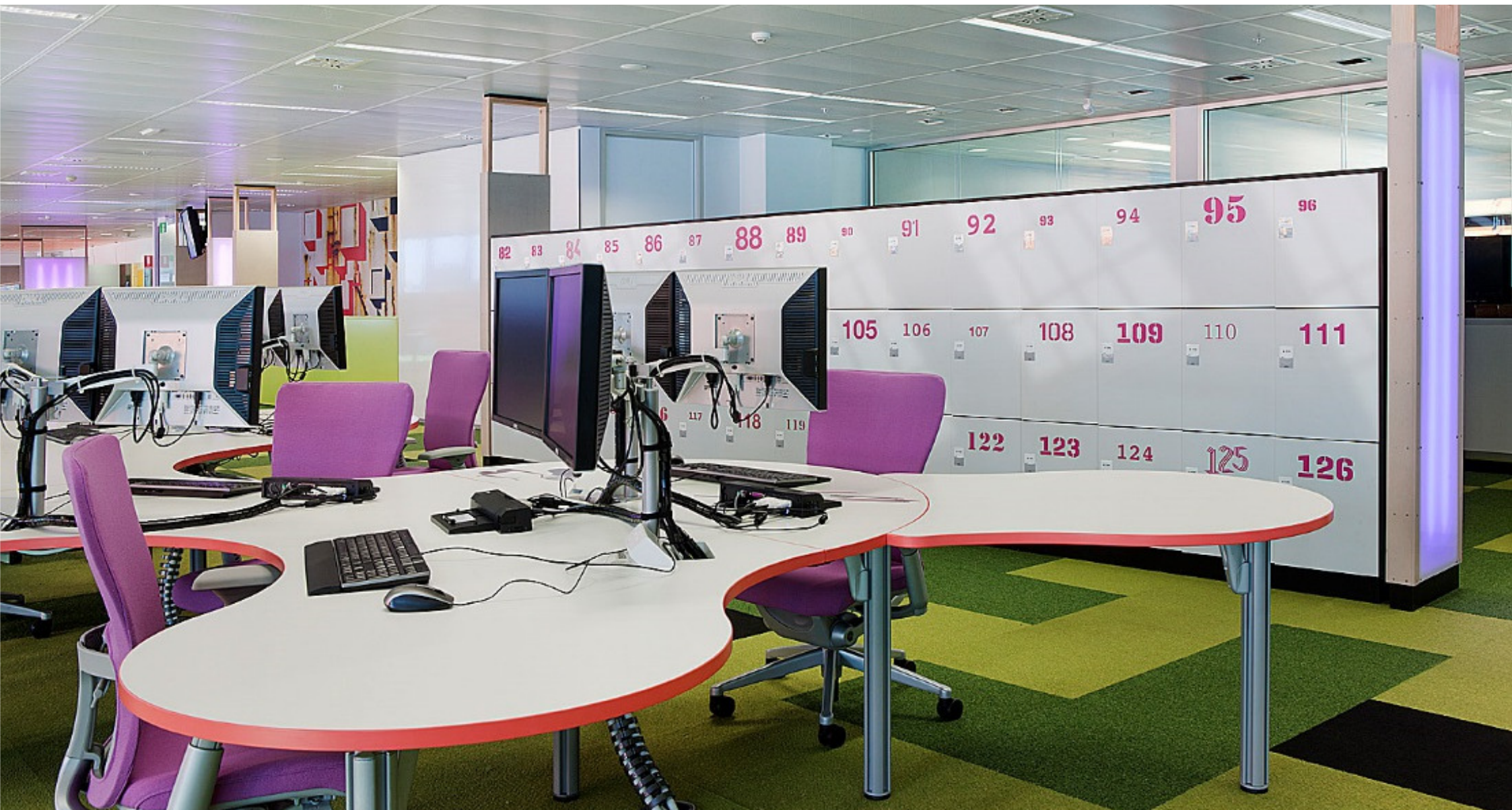
Macquarie Group, Sydney, Australia