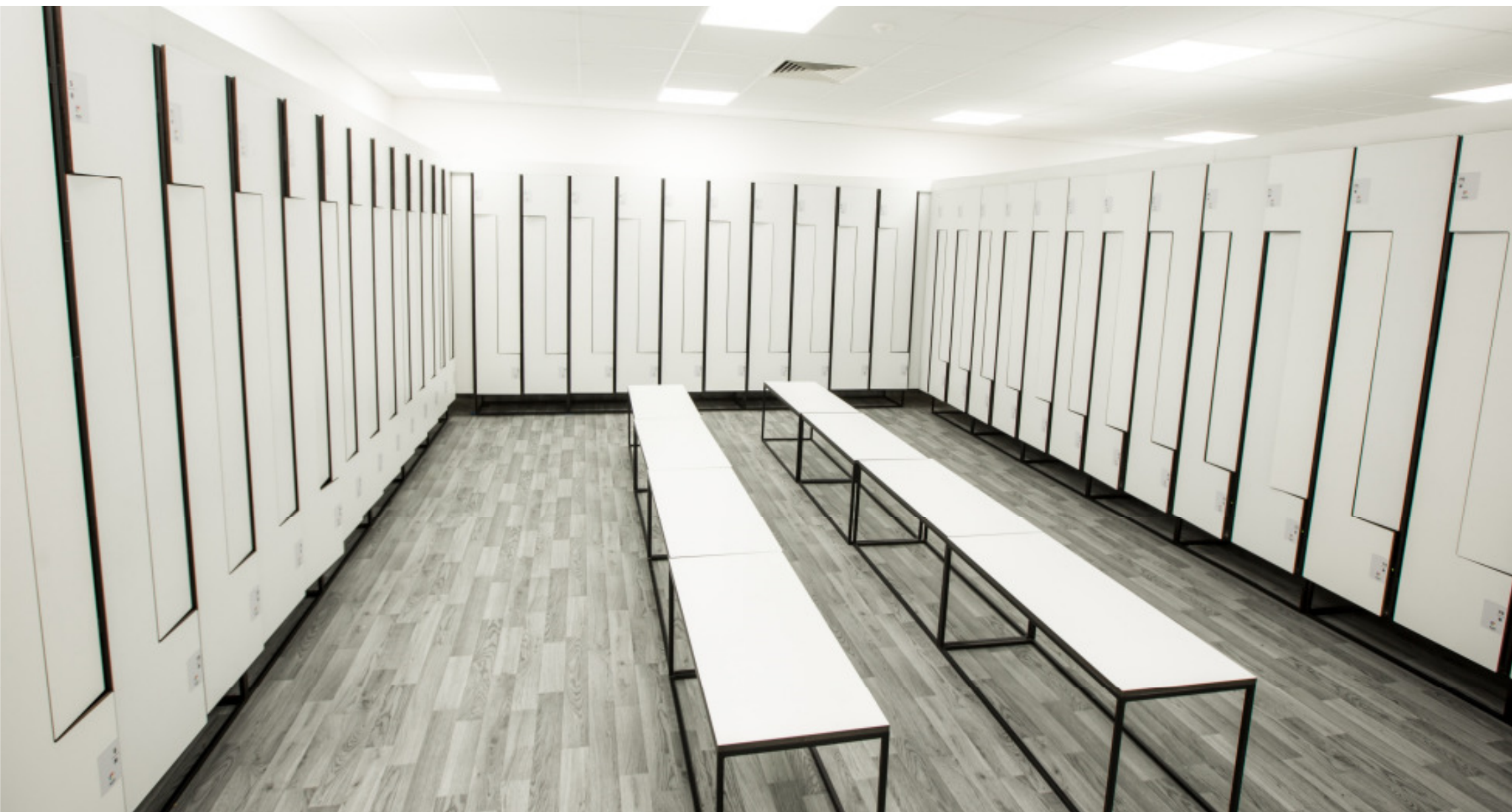
ONE LDN, London, United Kingdom