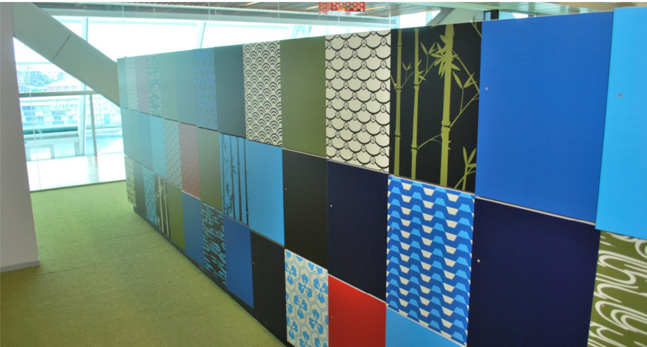
Macquarie Bank, Sydney, Australia