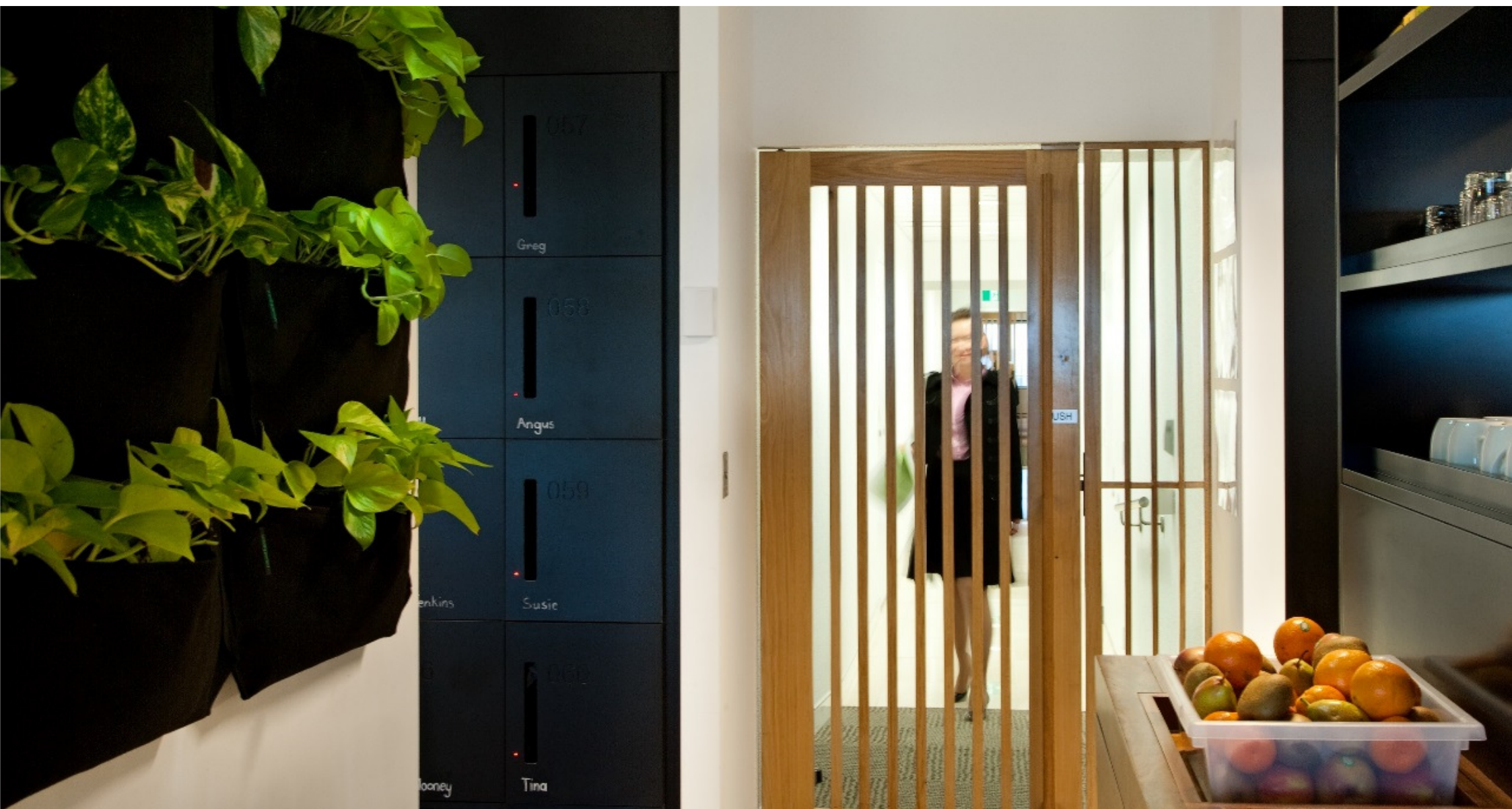
GPT, Sydney, Australia