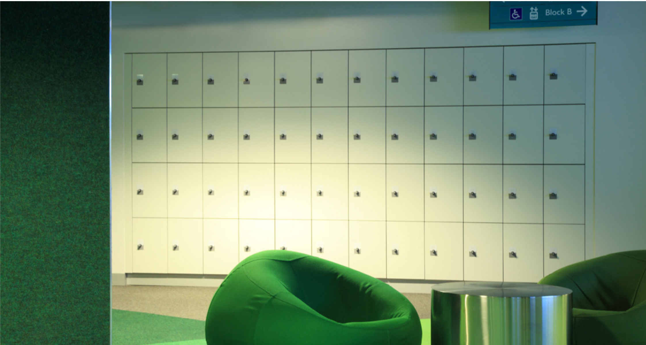
UTS, Sydney, Australia