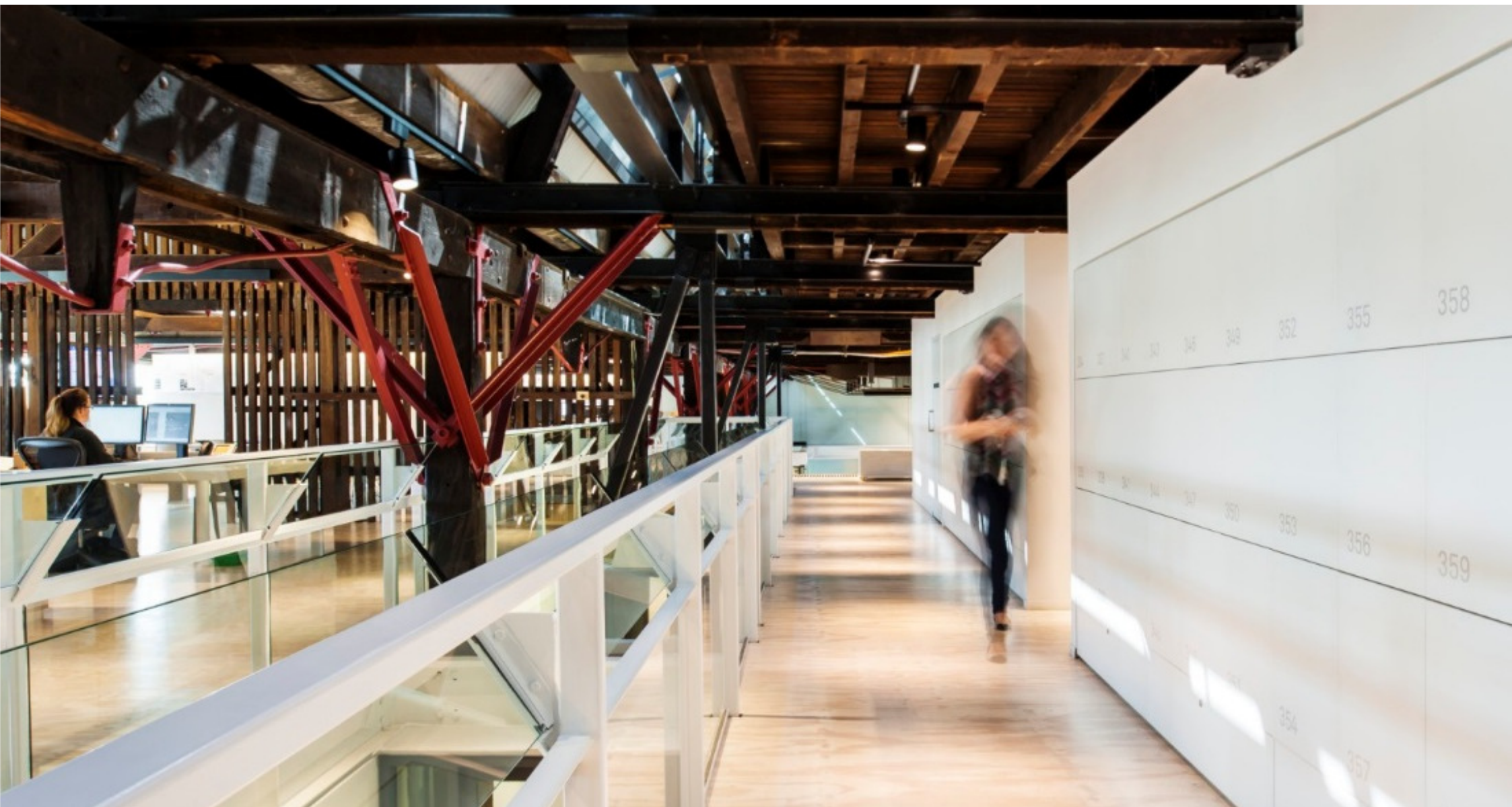
Hassel Architects, Sydney, Australia