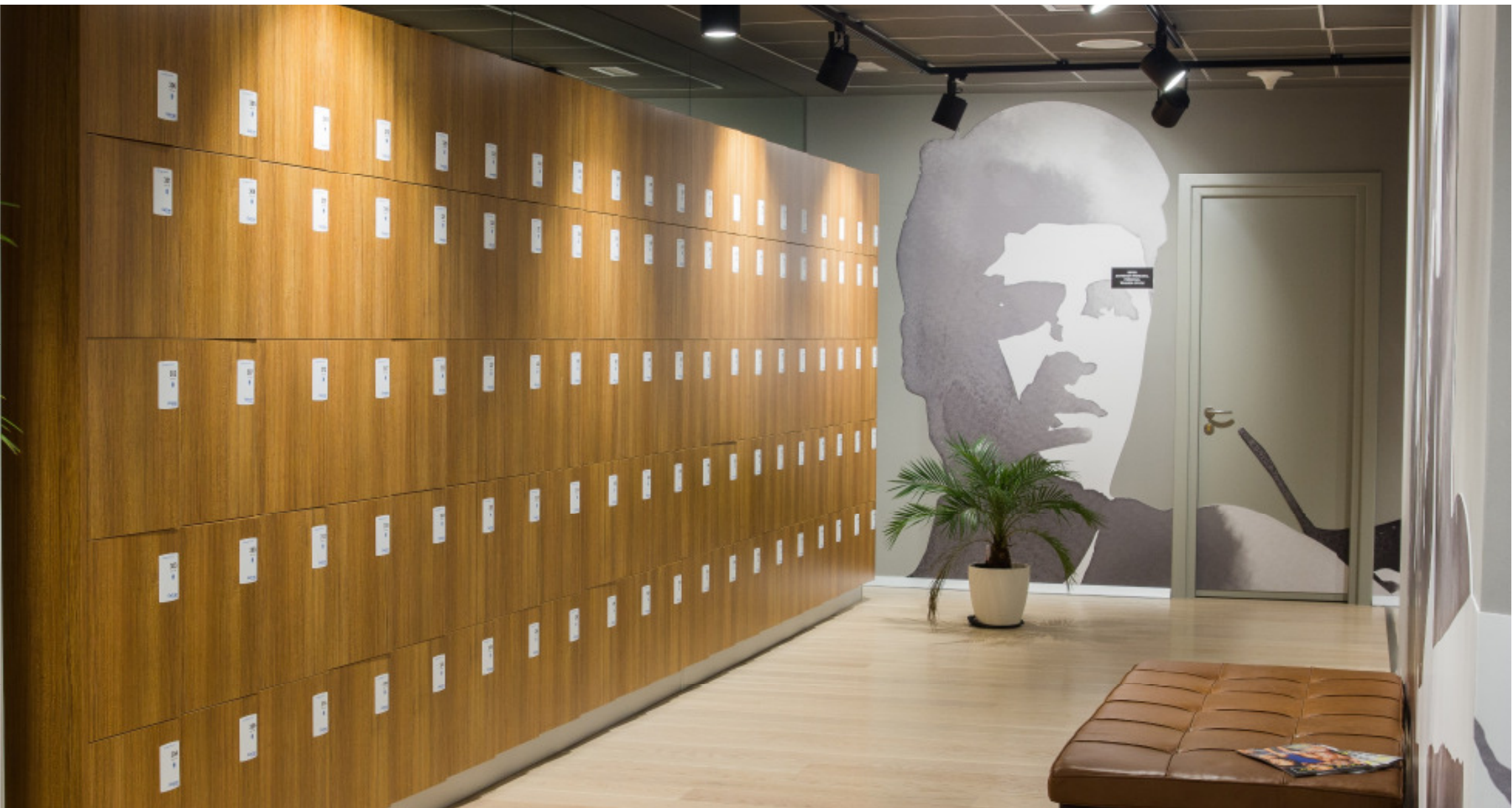
World Class, Bucharest, Romania